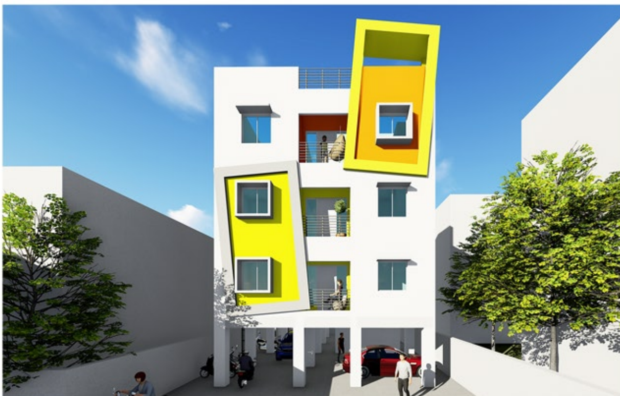
SUSEELA TOWERS (BLOCK - B)