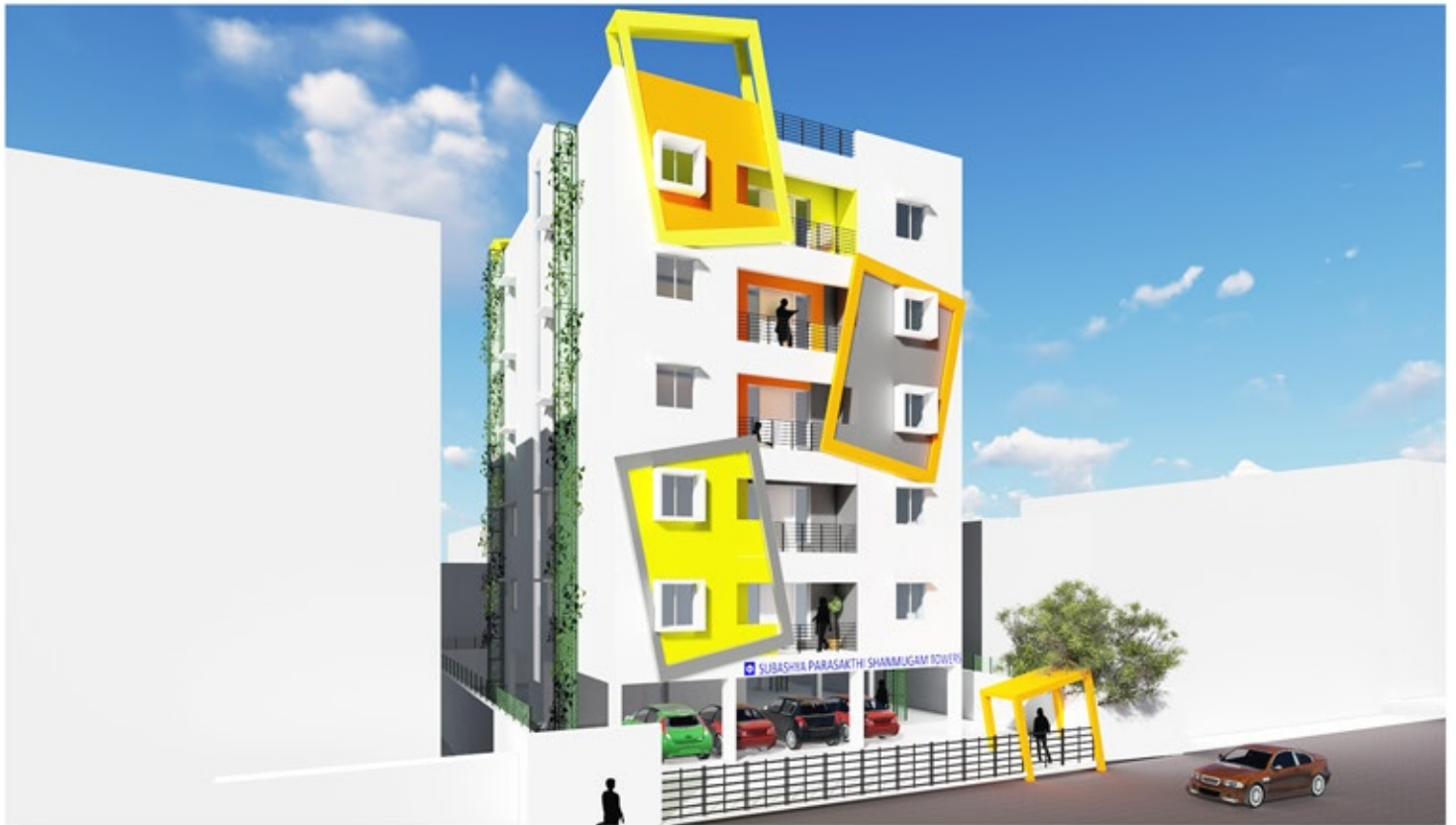
PARASAKTHI SHANMUGAM TOWERS (BLOCK - A)

SAI SUBASHYA APARTMENTS, Madipakkam Main Road