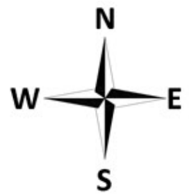
BLOCK B - TYPICAL FLOOR PLAN (Floors 1-3) SAI SUBASHYA - SUSEELA TOWERS